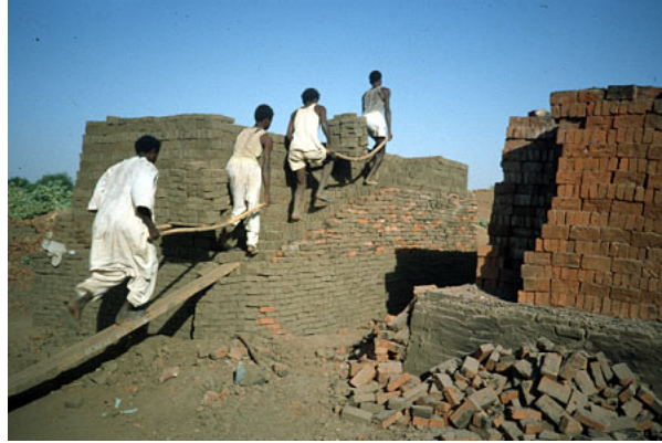
Figure 3: Staking of bricks for clamp-firing.

and enough water was added to give a workable plasticity. Each sample set consisted of 50 bricks, half of them slop-moulded in a double metal mould, and the other half sand-moulded in a single compartment wooden mould. Both moulds have the same dimensions (23 x 11 x 7 cm). All samples were sun-dried (8) for three weeks, and fired in a clamp kiln for four consecutive days (9) . Capacity of the kiln was completed to 14000 (10) bricks by loading 20 - 30% "normal" bricks together with the samples. After firing, 4 individual bricks from each sample set were packed and sent for testing strength, water absorption and density. Green and fired dimensions were also determined. Table (3) shows the experimental results for the slop and sandmoulded samples with the same dung content.