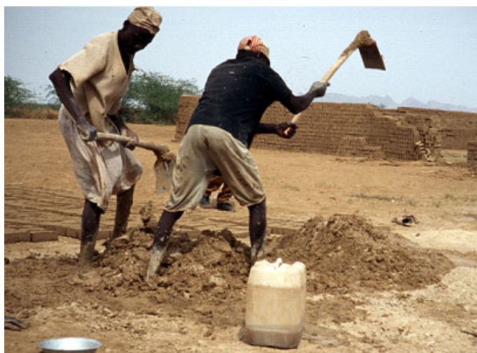
Figure 1: Preparation and mixing of cow-dung bricks.

Sudan is the largest country in Africa. Half of its 30 million inhabitants live on about 15% of the land (1) . Vegetation ranges from equatorial forest in the south to desert in the north, and semi-arid plain in the rest of the country. This plain is bounded by mountains and high plateaus on the countries western, southern and northeast boundaries. Tropical continental climate extends over most of the Sudan. Average rainfall is less than 25 mm in the north and increases to 1500 mm in the southern mountains. Temperatures range from 17°C in January to 47°C in April and May.