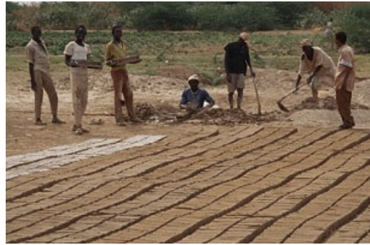
Figure 2: Slop-moulding and drying of bricks.

Cow-dung improves the plasticity of clays and acts as reinforcing agent reducing concentrated cracks that can lead to breakage within the raw bricks. Upon firing the dung fibres ignite, thus assisting in even firing of bricks and minimizing the development of high temperature gradients within the brick - a phenomenon which may lead to firing cracks. When the fibres burn out they leave cavities within the brick which reduce unit weight and improve thermal characteristics. Cavities on top and bottom surfaces of the bricks increase the bond when bricks are laid in a mortar bed.